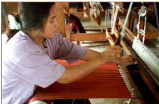
Weaving and confection